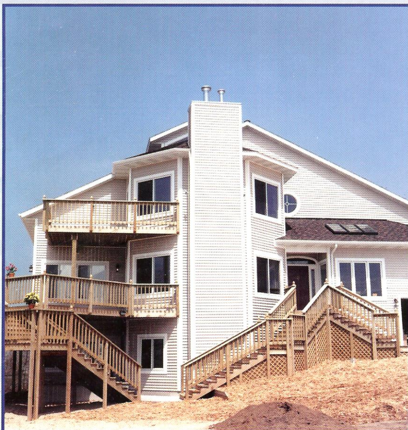
Residential New Construction: Northwind Construction Inc.; South Juniper Beach, Mears, MI; Rollex Corporation

Contractor: Siding Group Division of Professional Remodeling Site: 3241 N. Clifton Chicago, IL Producer: Wolverine Technologies